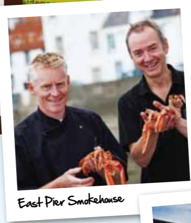
East Pier Smokehouse