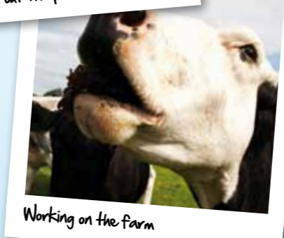
Working on the farm