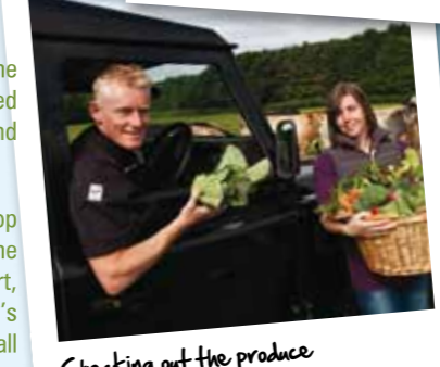
Checking out the produce