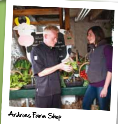
Ardross Farm Shop

We've started at Kellie Castle, a stunning National Trust for Scotland property in the heart of rural Fife, and we're bowled over by the rhubarb alone, never mind the riches that await us indoors.